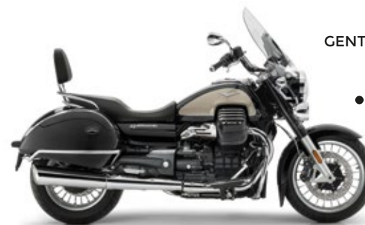
● NERO GENTLEMAN