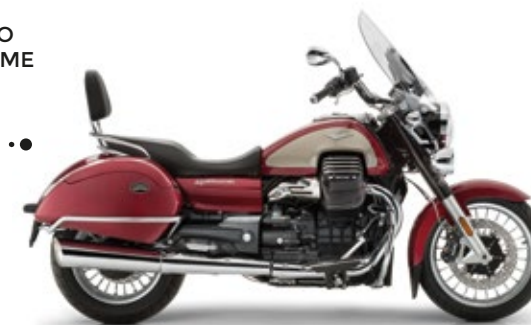
● ROSSO CHARME